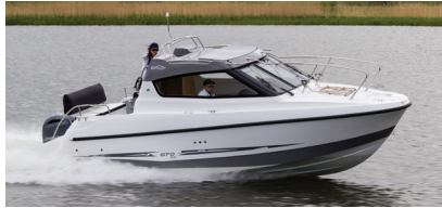
670 Middle Cabin